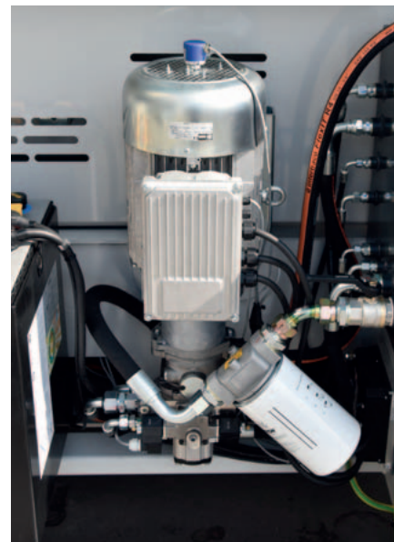
AC electric power unit