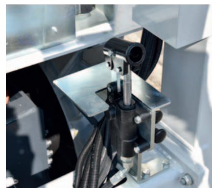
Stabilizers manual descent device